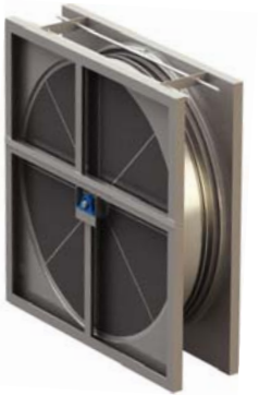
Rotating adsorption dryer -compact design